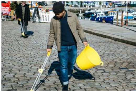
Beach cleans and litter picks

We appreciate that coming to the Aquarium is not always possible, which is why we also have an outreach programme, where we can come to you or take an adventure to the coast! Our outreach is available throughout the year, and include: